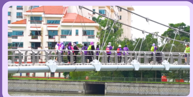
First Ain Society Cancer Walk