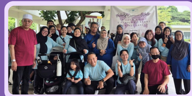
Ain Society World Cancer Walk