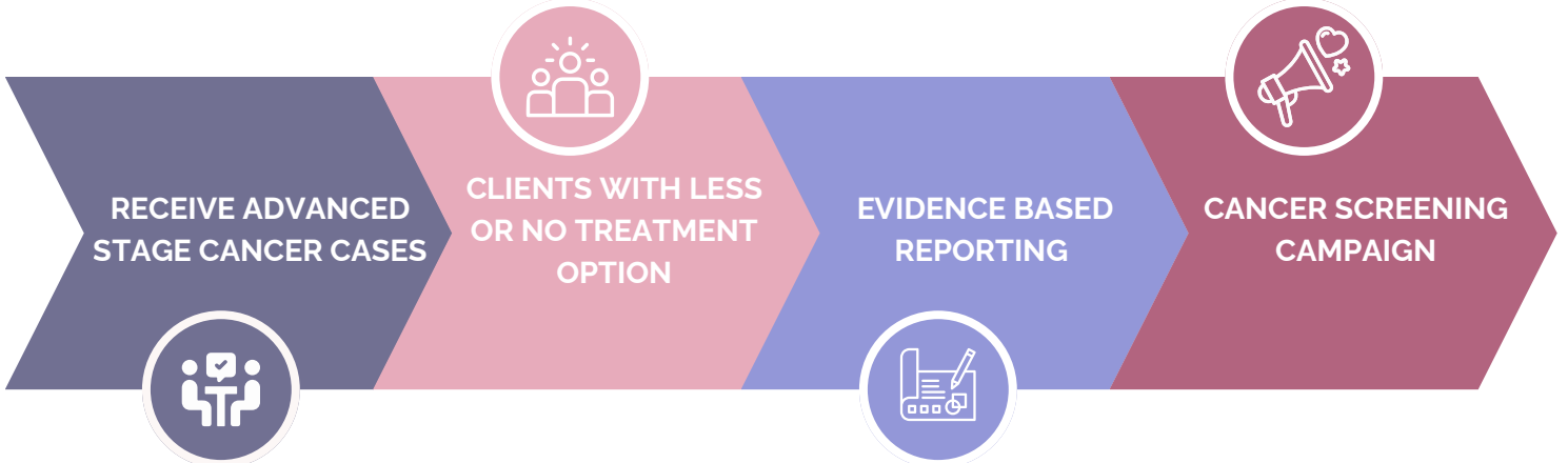
Cancer Screening Participation Rates (YEAR)